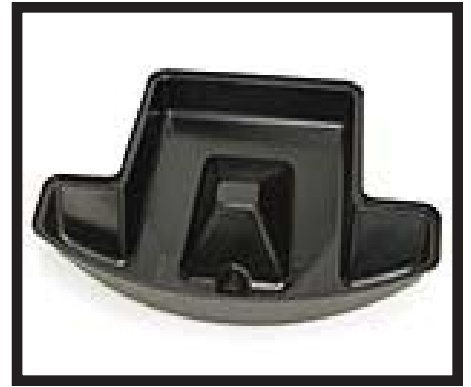
62866 Drip Pan Pic 6