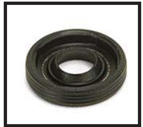
61459 Whipper Base Seal