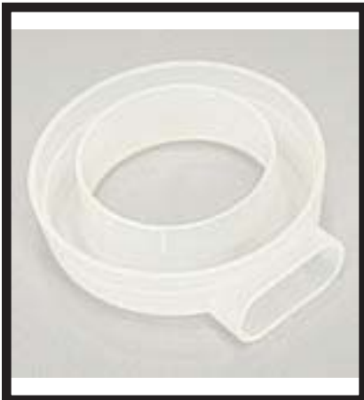
61255 Steam Shroud