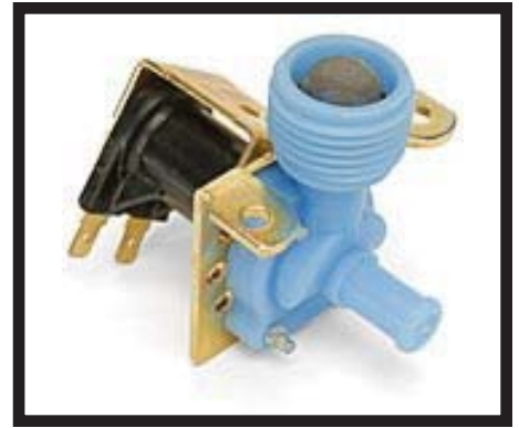
61104 Inlet Valve