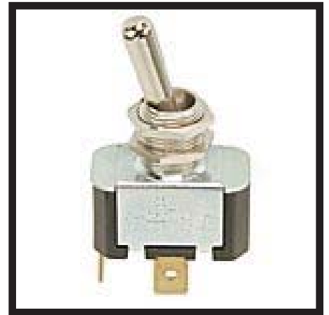
61847 Power Switch