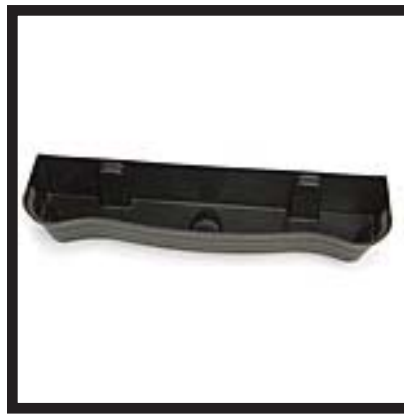
63165 Drip Pan Pic4