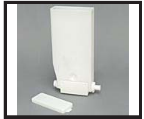
62639 5.5 LB Hopper Assy.