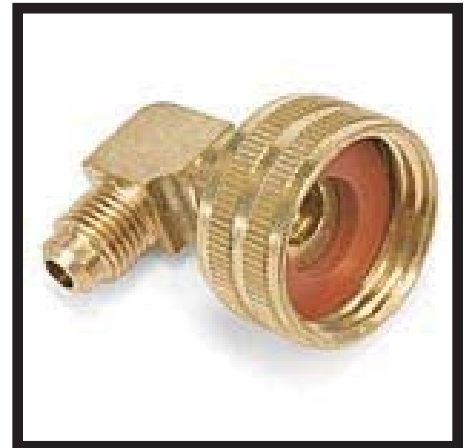
61237 Inlet Adapter