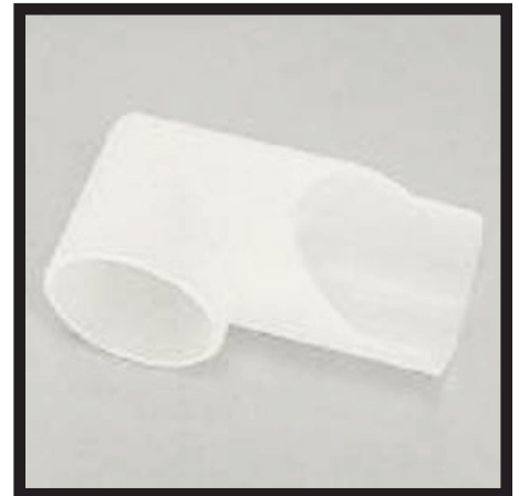
63454 240 Degree Elbow