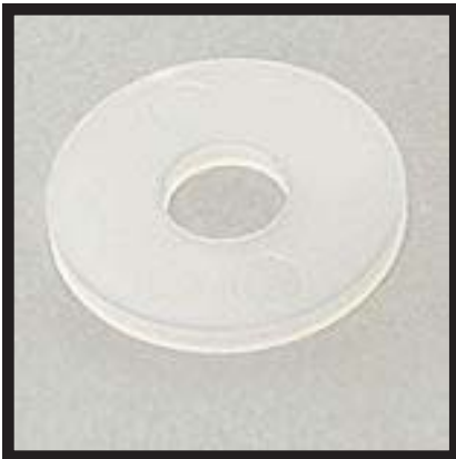
61334 Slinger Washer