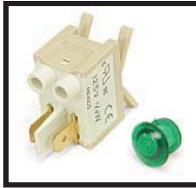
63495 Green Lamp