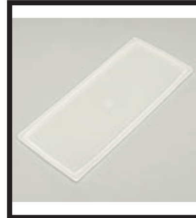
61315 Hopper Lid