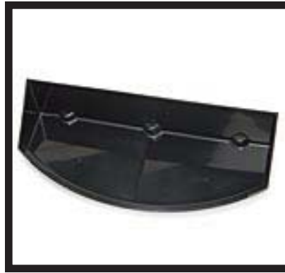
62335 Drip Pan Lowered