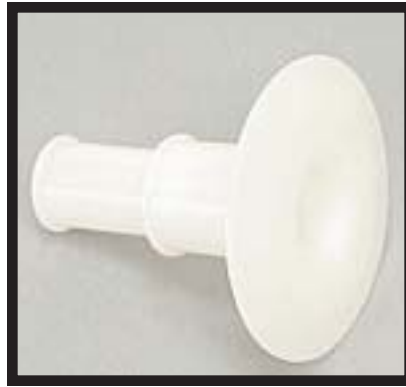
61226 Funnel Quick Disconnect