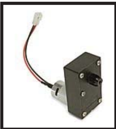
100090 Gearbox (pic 4)