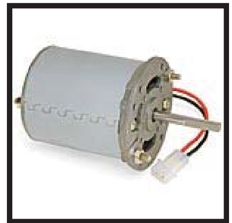
61116-01 Whipper Motor