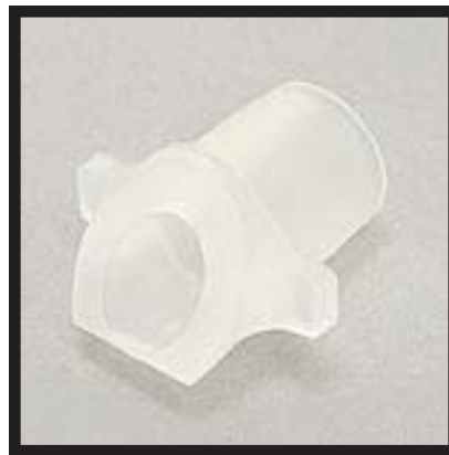
61461 Angled Restrictor Button