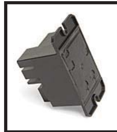
61131 Heater Relay