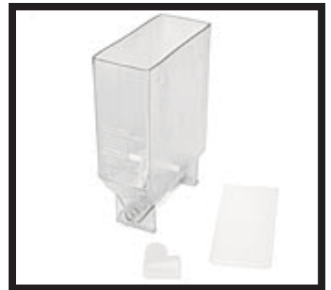
61372 Hopper Assy.