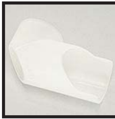
100549 300 degree Elbow