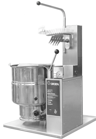
Model TDB TA/2

Electrically heated Table top mounted Tilting Kettle Tilt out Agitator Drive System Variable Speed Agitator Controls For 20 and 40 quart kettles TDB-20, TA/2 TDB-40, TA/2