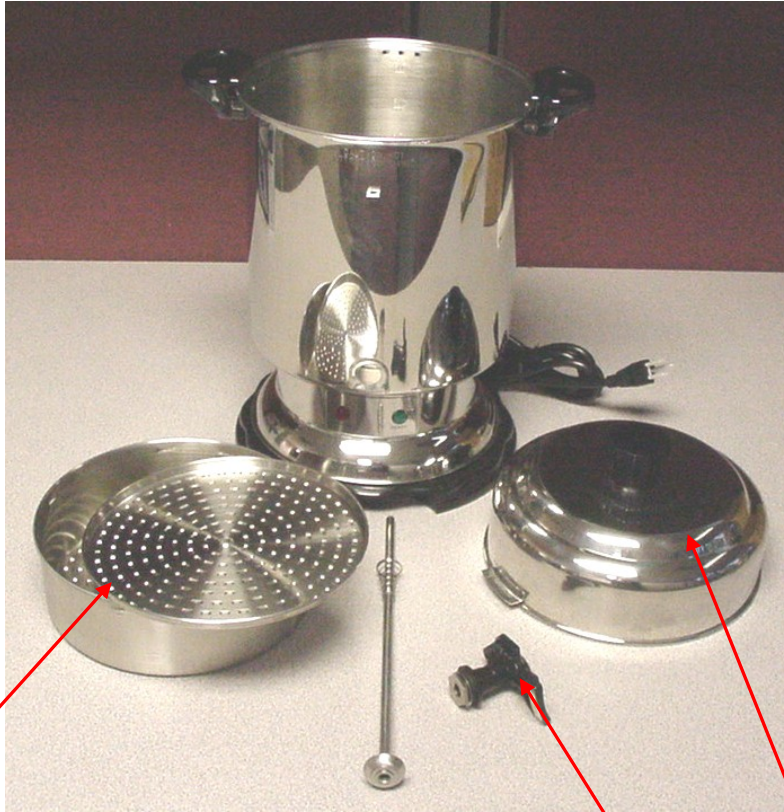
Filter Basket w/ Lid 990016601

PROPRIETARY RIGHTS NOTICE This document and all information contained within it is the property of Hamilton Beach Brands, Inc. (HBB). It is confidential and proprietary and has been provided to you for a limited purpose. It must be returned or destroyed upon request. Disclosure, reproduction or use of this document and any information contained within it, in full or in part, for any purpose is forbidden without the prior written consent of HBB. No photographs may be taken of any article fabricated or assembled from this document without the prior written consent of HBB.