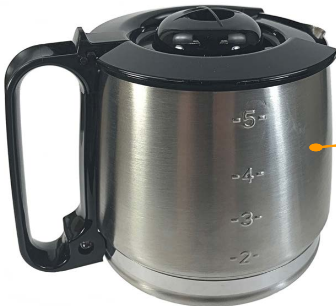
Carafe Complete, Stainless Steel 990143500