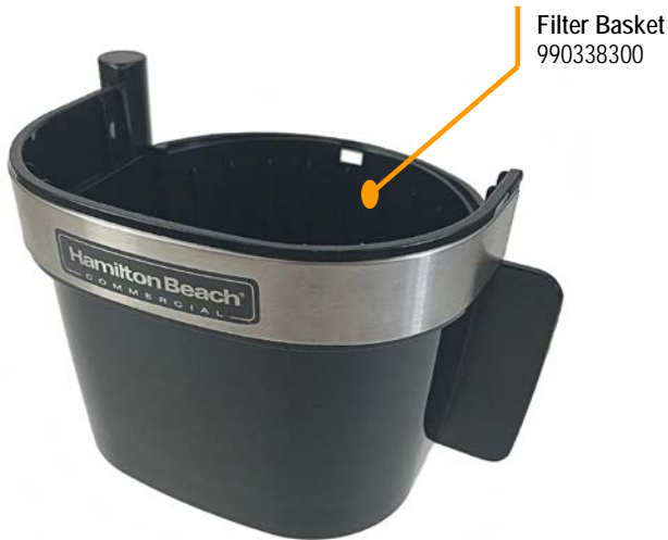
Filter Basket 990338300