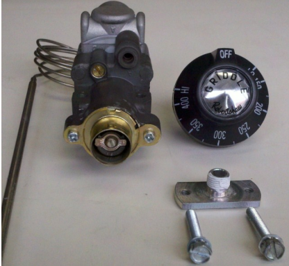
Figure 11. Fry Top Thermostat

The model BJ Robertshaw is a combination thermostat and gas valve. The gas is turned on and the temperature setting made by a single rotation of the dial. This valve automatically locks itself in the OFF position. To use, push dial inward, rotate counter-clockwise to the desired temperature. To shut gas off, rotate clockwise to OFF position.