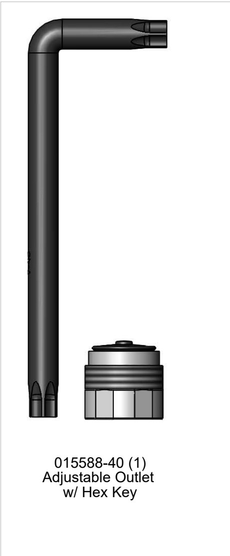
015588-40 (1) Adjustable Outlet w/ Hex Key