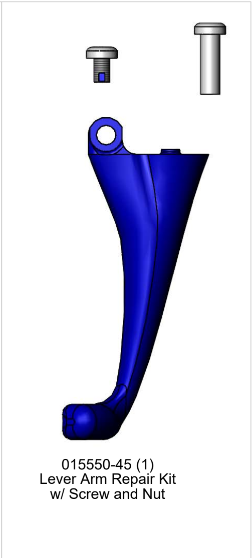
015550-45 (1) Lever Arm Repair Kit w/ Screw and Nut

Product Specifications: Glass Filler Repair Kit