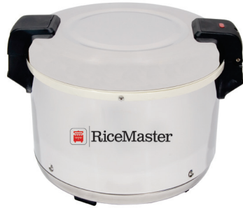
56916-S 18 QUART, STAINLESS STEEL BODY, 120V AC