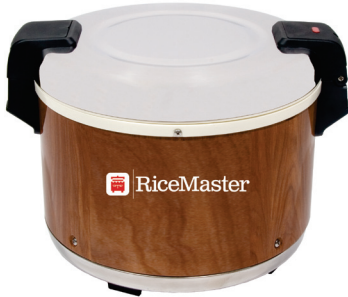
56916-W 18 QUART, WOODGRAIN BODY, 120V AC