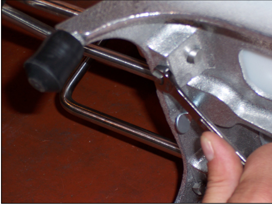
Figure 3. Pusher Head Adjustment Through the Blades.