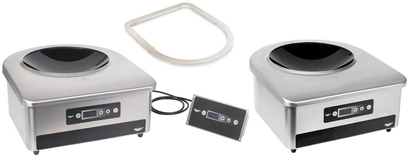
Drop-In Model shown with accessory kit - purchase separately.